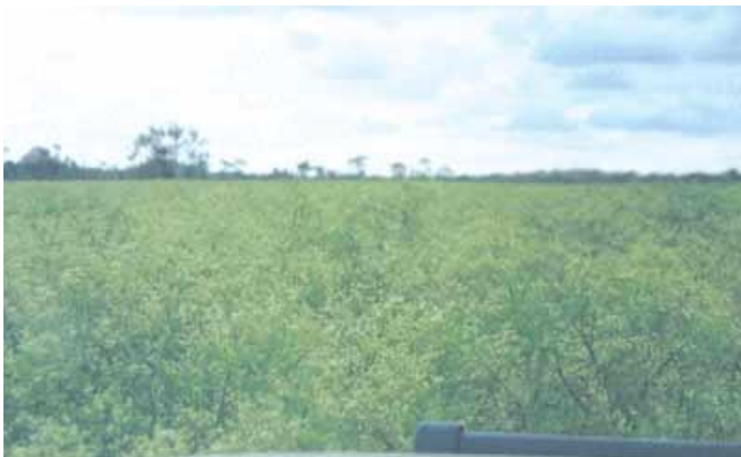
▲ Parthenium weed.

In Queensland the annual cost of parthenium weed to grazing and cropping industries (in production losses and on-farm control costs) has been estimated at $16 million and $6 million respectively. Biological control programs funded by Queensland government departments have cost a further $9 million and the expenditure on roadside controls and washdown facilities has also been significant. In New South Wales the cost of parthenium weed prevention is high. The environmental and social costs have not been quantified but the serious allergic reactions in humans are well known, and significant impacts on biodiversity have been observed.