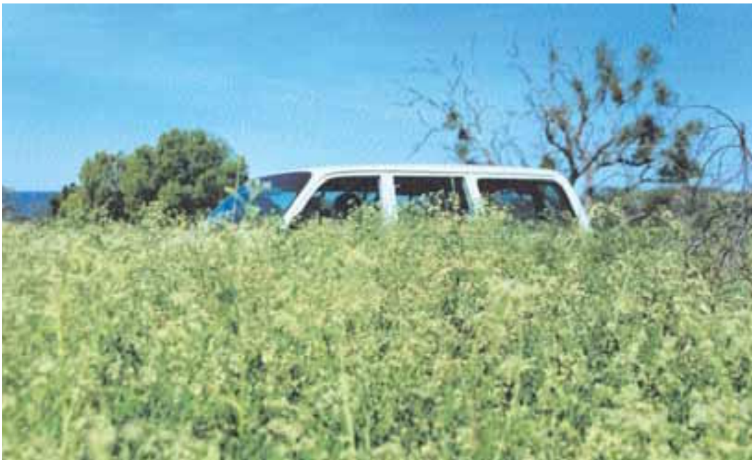
▲ A dense infestation of parthenium weed in central Queensland.

This book describes parthenium weed and provides basic information about its ecology and biology, reproduction and spread, current distribution, and potential threat. It also provides information on management and control aspects including spread minimisation, pasture management, herbicide use, biological control and health aspects.