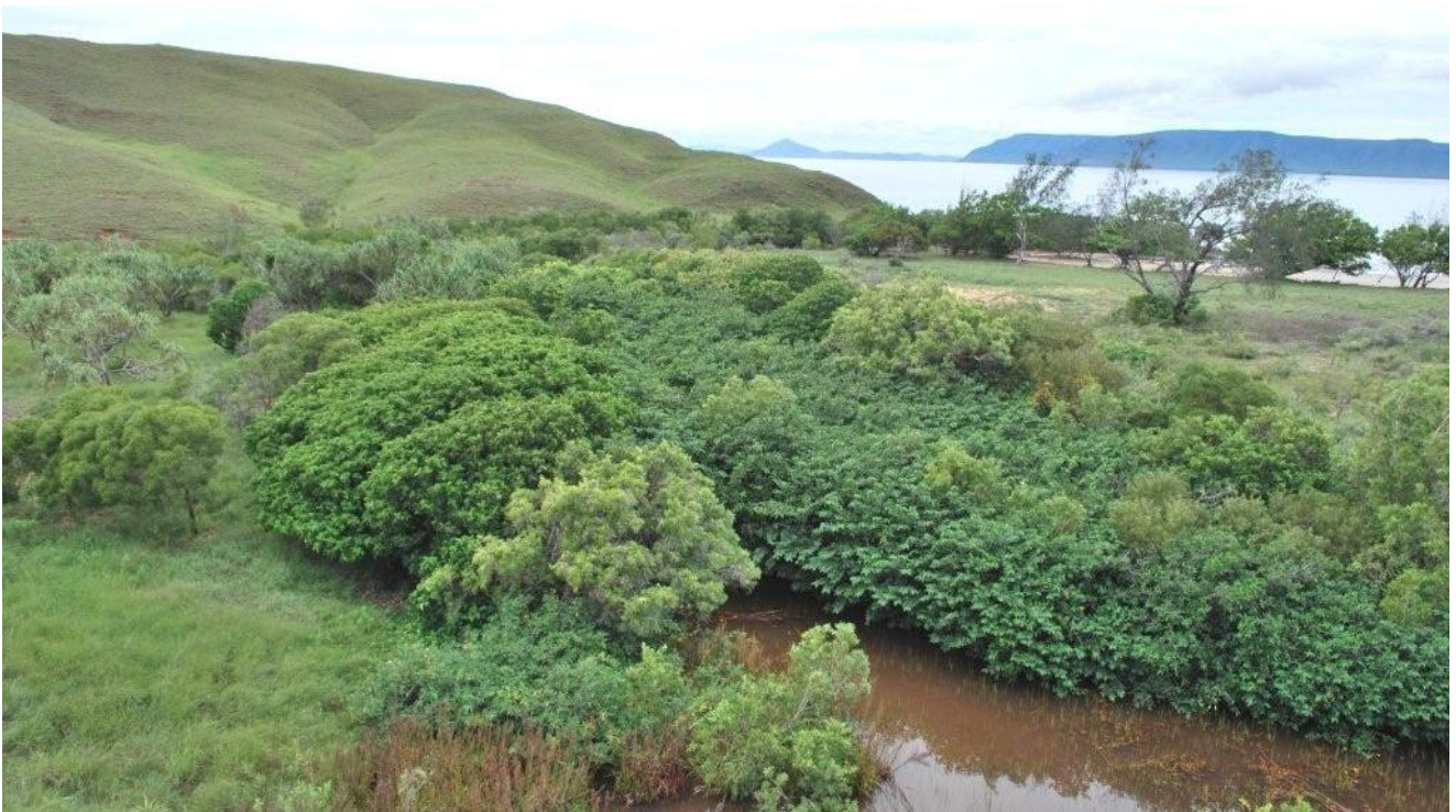
Pond Apple infestation (south of Indian Head), north of Cooktown, Cape York Peninsula