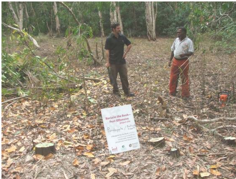
Pond apple control (cut stump) Blueprint for the Bush, Pest Offensive project