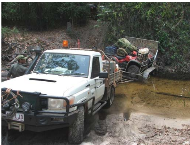
Limited access into pond apple infestations—Temple Bay, Cape York Peninsula

Sydes, T (2009) 'Adaptive management', Pond apple workshop minutes, FNQROC, Cairns.