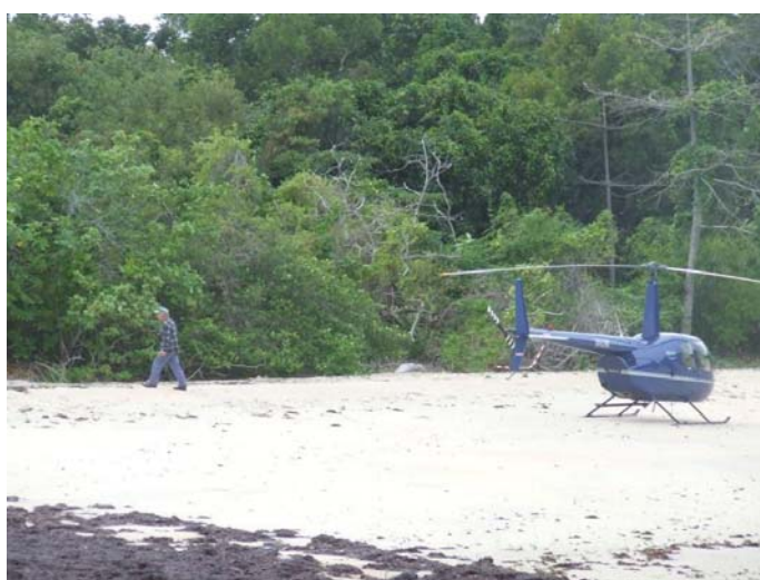
Pond apple aerial survey—Fritz Creek, Bloomfield region