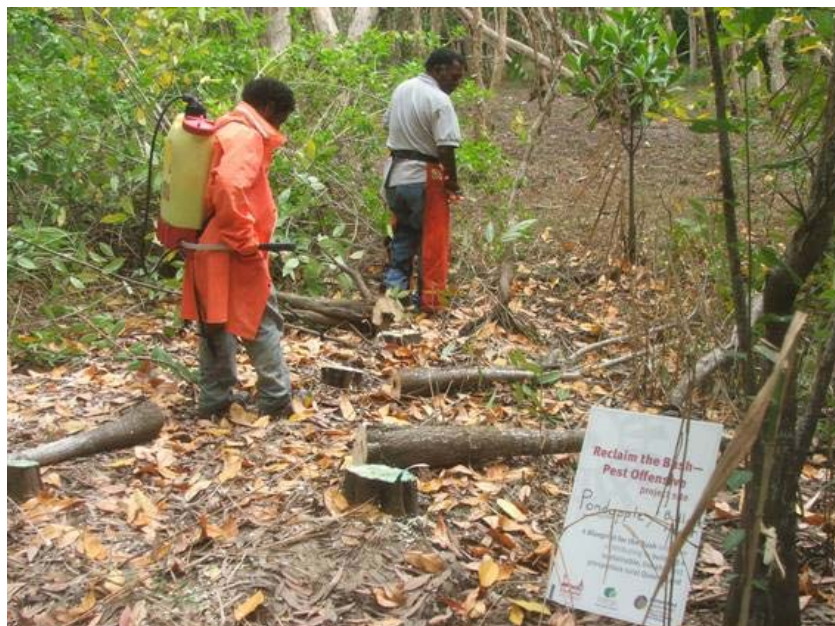
Pond apple control is 100% selective and effective—herbicide treatment of stumps