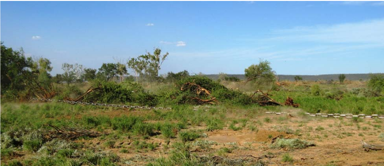
Figure 1. Chain pulling of mesquite in the Hughenden area has proved effective for large dense stands.

While containment remains the primary aim, a progressive reduction of density and extent is achievable at Hughenden. To progress this aim, there is a need for further containment planning, including the development of updated infestation (density and extent) maps.