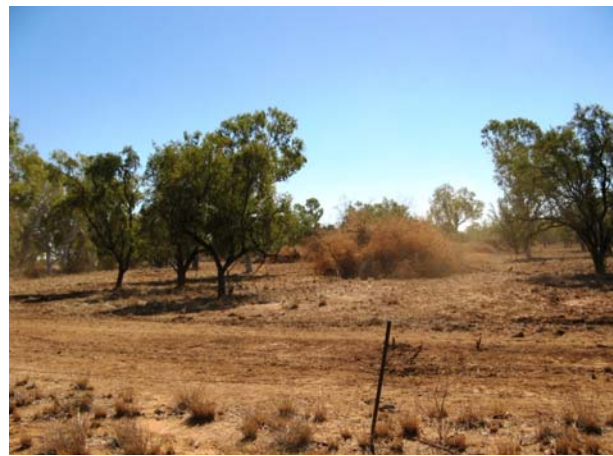
Figure 5 (left). Successful control of mesquite in the lower Gulf near Burketown has assisted in the protection of the Harris Lakes wetlands. Figure 6 (right). Selective mechanical clearing has removed high density infestations associated with the Williams River floodplain near Cloncurry. The site will be managed to encourage pasture regrowth.