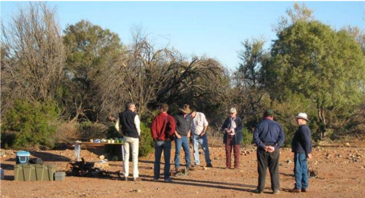
Figure 3. NPBMG and New South Wales Prickle Bush Working Group members conducted a field tour to inspect mesquite infestations and landholder control achievements south of Broken Hill.

government subsidy payment program for landholders who carried out mesquite control on their land.