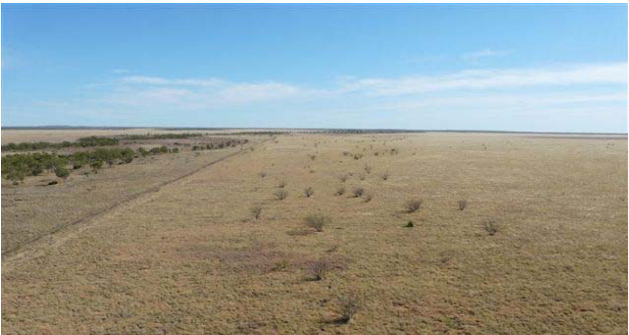
Figure 4. Scattered mesquite (centre) invading native grasslands in the east Kimberley. This site was aerially surveyed in 2008.

Progressive control of strategic infestations in the Gascoyne, Pilbara and Kimberley will be required over the medium to long term.