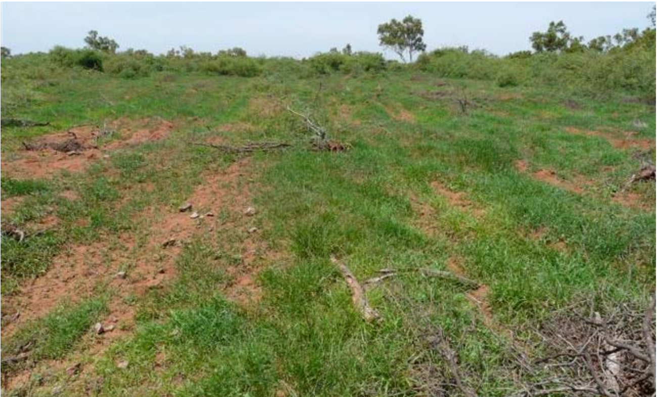
Figure 2. Blade plough trials in the Pilbara showing pasture regeneration

months (in addition to $150,000 in 2007–08). This support also included capacity building training for the Project Manager.