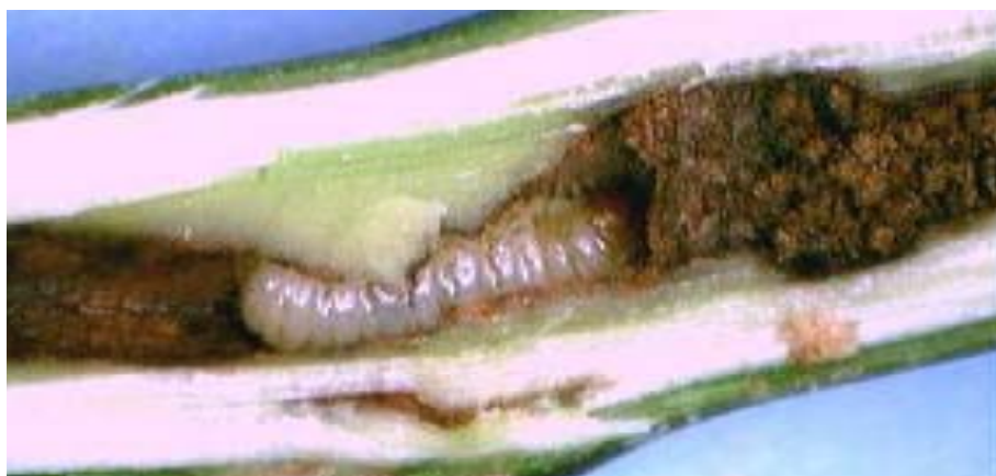
Figure 2. The stem-boring moth ( Ofatulena luminosa ) is one of the promising agents being studied for biological control.

The stem-boring moth ( Ofatulena luminosa ) from Mexico may be host-specific; affected branches rarely flower or pod. The defoliating caterpillar ( Eureupithecia cisplatensis ) is a looper caterpillar from Argentina and causes impressive damage to the leaves of plants.