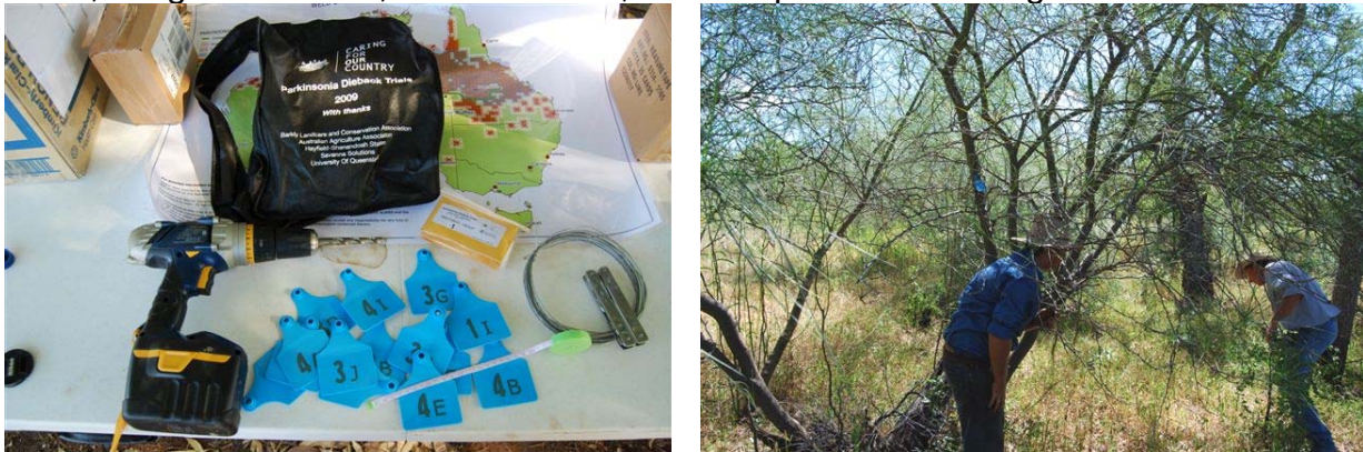
Figures 3 and 4. The Parkinsonia Dieback Workshop kit and tools (left) with a trial being established during the workshop (right).

The project received $199,750 and was administered by the Victoria River District Conservation Association. One of the three workshops was held on Delamere Station with a significant number of local and regional stakeholders in attendance. The workshop trained participants in setting up trial sites with 60 sites now established on pastoral lands, Indigenous lands, defence lands, national parks and mining leases.