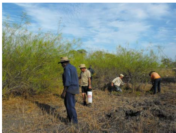
Figures 8 and 9. Cape York wetlands under threat of parkinsonia (left) are the focus of control (right) by Aurukun community members and the Cape York Weeds and Feral Animals Program team.