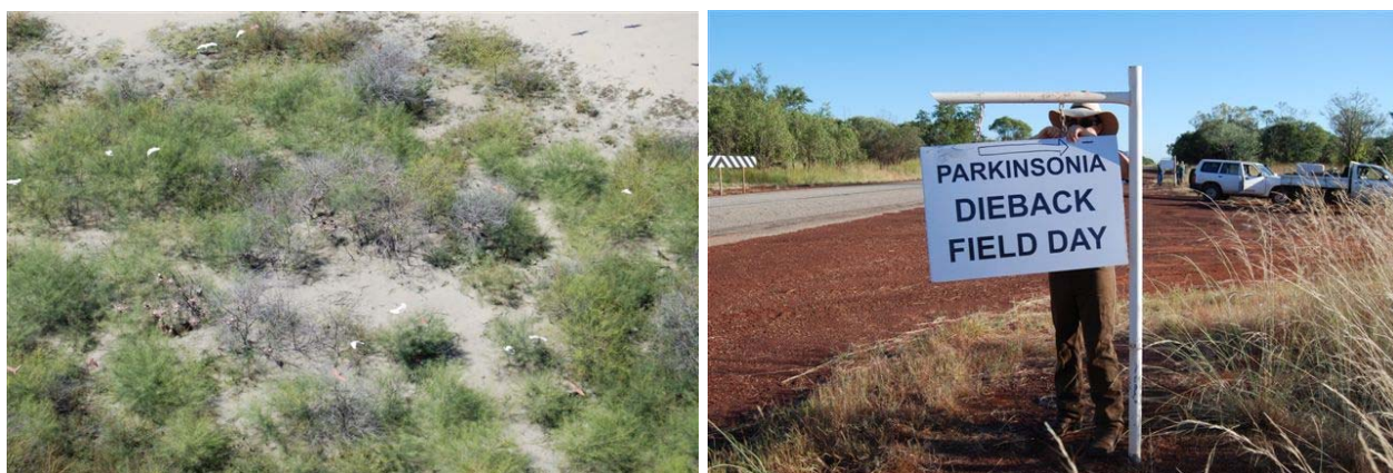
Figures 6 and 7. Parkinsonia dieback is spreading at a wetland trial site (left), which was the focus of a field day in April 2009. (Images: Dr Vic Galea, UQ)

Two key activities occurred during 2008–09. Firstly, the NLP-funded project 'Protection of Conservation and Production Values of the Sturt Plateau' was led by the Sturt Plateau Best Practice Control Group. It contributed to parkinsonia management through surveying, mapping and control of priority weeds, which included the discovery of two new infestations. A total of 24,876 km 2 were surveyed. Secondly, one of the Parkinsonia Dieback Workshops was held on Hayfield Station and enabled the training of participants to establish dieback trials. Participants were able to fly over an earlier initiated trial site and view the successful spread of dieback.